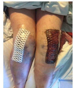
Clean vs 100% soiled